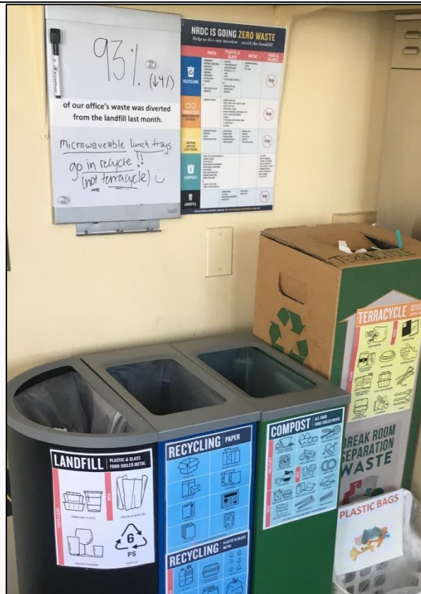
Figure 1. Example of an all-inclusive waste station. It includes: municipal recycling, compost, landfill, TerraCycle, and (when appropriate) plastic bag bundling